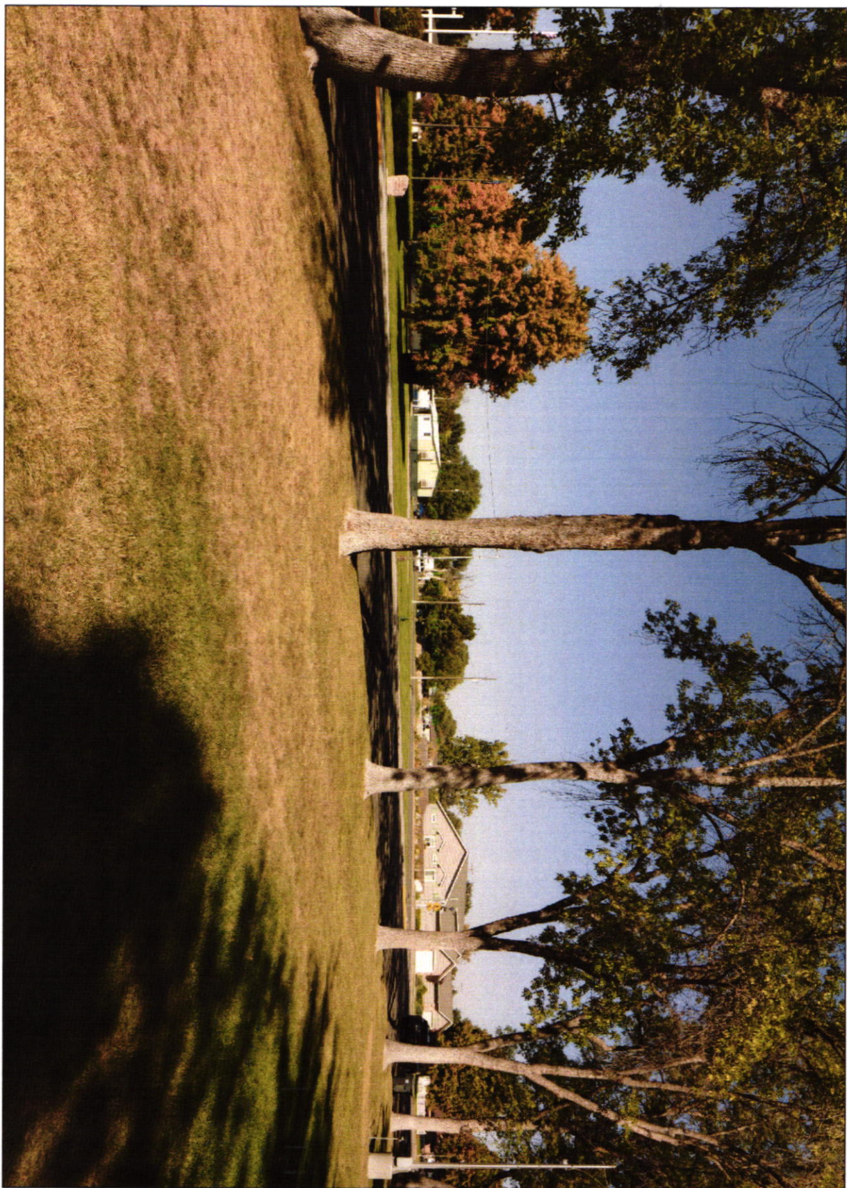
Viewpoint 06 - Wendell - City Park, Looking Northeast - 113m Hub Height Green Overlay

Viewpoint 05 is located on the Wendell - City Park, looking Northeast. The view is taken from a height of 100 feet. The view is taken from a distance of 100 feet. The view is taken from a distance of 100 feet.