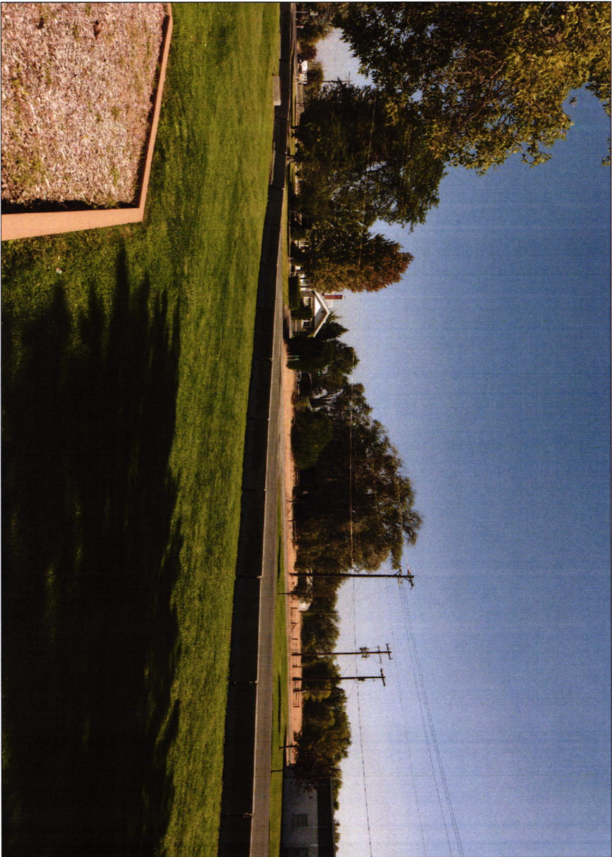
Viewpoint 02 - Gooding - East Park, Looking Southeast - 113m Hub Height Proposed View