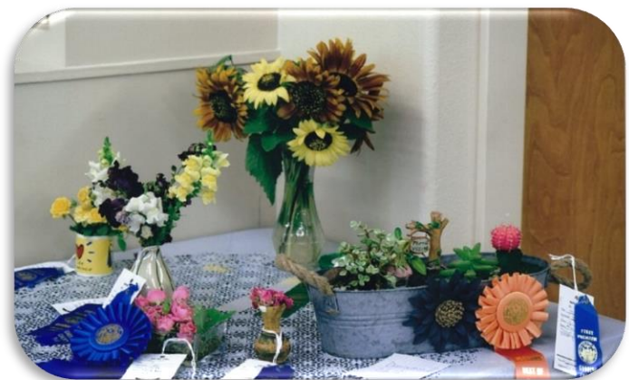
2018 Division II Winner

(Children must plant and care for container and arrange bouquets themselves.)